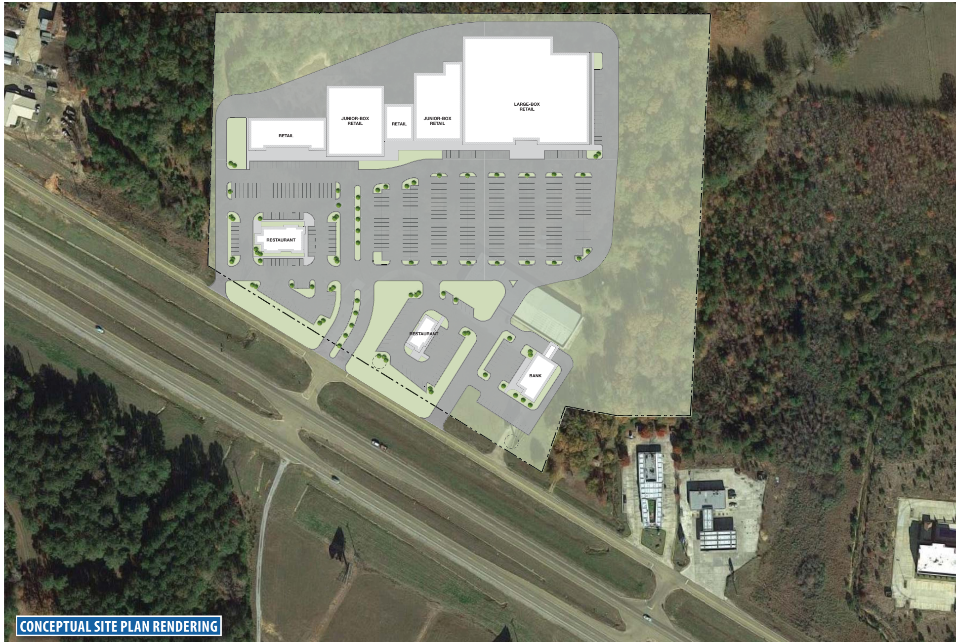
CONCEPTUAL SITE PLAN RENDERING

MS HIGHWAY 16 | PHILADELPHIA, MISSISSIPPI 39350